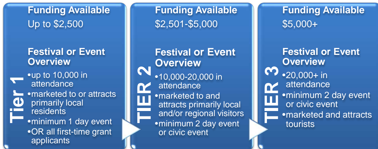
Figure 1. Funding Levels