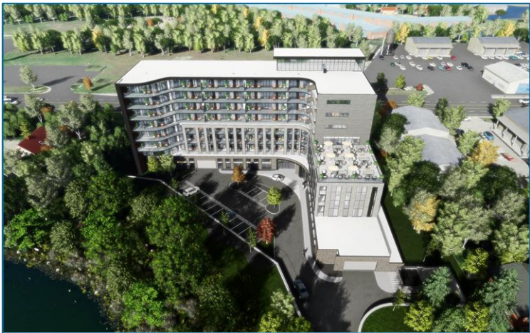
Conceptual render, view looking north.

https://www.eventbrite.com/e/public-open-house-7-pm-application-for-625-643-atherley-rd-orillia-tickets-169117680535