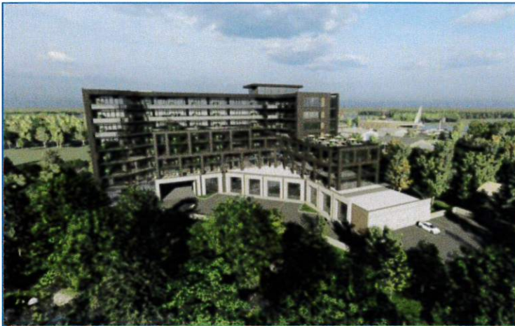
Conceptual render, view looking north.

https://www.eventbrite.com/e/public-open-house-625-643-atherley-road-zoning-change-7-to-8-pm-tickets-539744559507