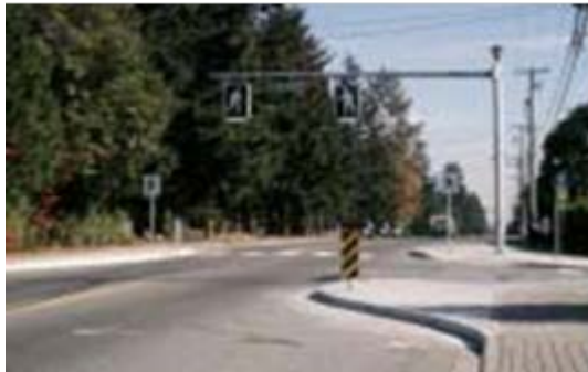
Figure 4 – Curb Extension

Curb extensions are sometimes referred to as bulb-outs or neck-downs. They can be used at intersections and at midblock locations, and can be used alone or in combination with a textured crosswalk and/or a median island. In addition to their pedestrian safety benefits, curb extensions on one or both sides of the roadway also help to reduce vehicle speeds. Curb extensions may be considered for use on both local and collector roadways, including transit and emergency response routes.