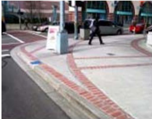
Figure 6 – Curb Radius Reduction

Curb radius reduction is the reconstruction of an intersection corner to a smaller radius. This measure effectively slows down right-turning vehicle speeds by making the corner 'tighter' with a smaller radius. A corner radius reduction may also improve pedestrian safety to a certain degree by shortening the crossing distance. This type of measure is acceptable on local and collector roadways, but its use is often limited to specific situations where the existing intersection geometry would allow the reconstruction. In addition, curb radius reductions should not be used on transit routes requiring a right turn.