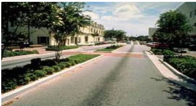
Figure 8 – Raised Median (with Textured Crosswalk) 13

Raised median islands are installed in the centre of a roadway to reduce the overall width of the travelled lanes. They help slow traffic without affecting the capacity of the road. Raised median islands can be combined with curb extensions and/or textured crosswalks to further improve pedestrian safety. This measure may be considered on both local and collector roadways.