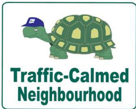
Figure 15 – Traffic Calming Sign, Mississauga, ON

“Traffic-Calmed Neighbourhood” signage is used to notify motorists and other road users that they are about to enter a neighbourhood that has been ‘calmed’ by the installation of various traffic calming measures. Although this signage alone does not have any significant impact on driver behaviour, it aims to make the motorist aware of the conditions they are about to enter and could potentially act as a ‘deterrent’ for motorists looking for a short-cut.