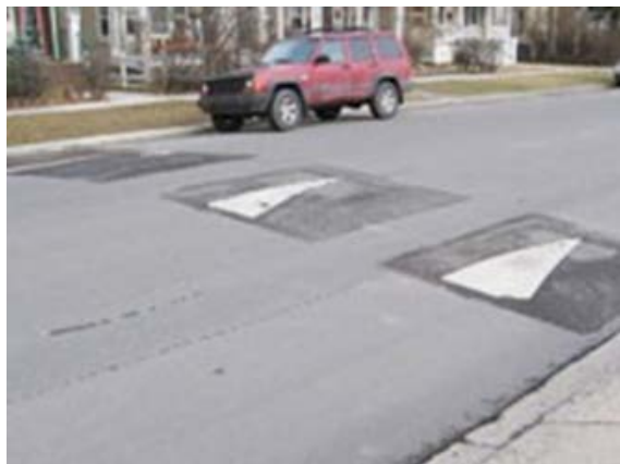
Figure 3 – Speed Cushions for Emergency Vehicles 10