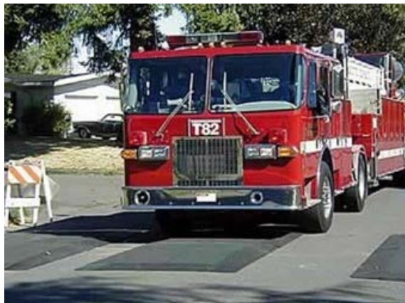
Figure 2 – Speed Cushions, Calgary, AB 9