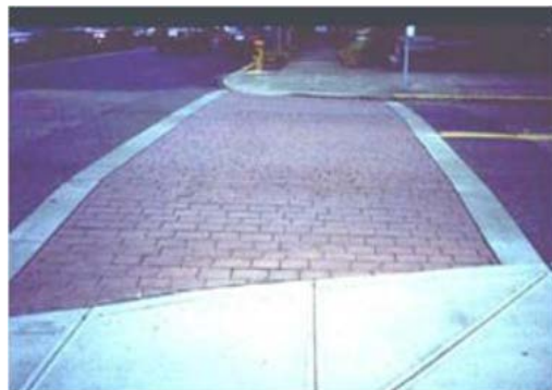
Figure 16 – Textured Crosswalk, Portland, OR