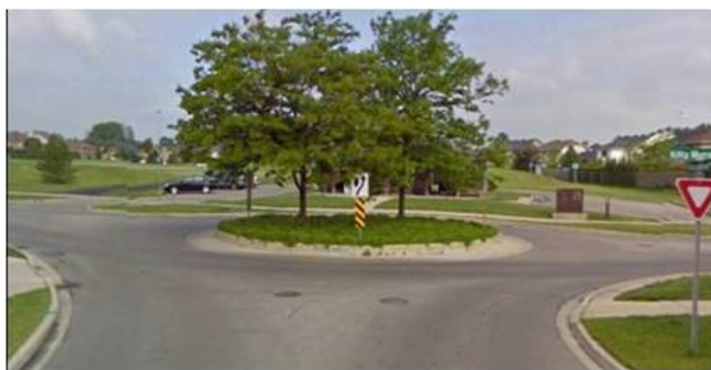
Figure 9 – Traffic Circle, Ancaster, ON

Traffic circles are a raised island located in the centre of an intersection designed to reduce vehicle speeds and reduce vehicle-vehicle conflicts. Intersection should have balanced traffic volumes. Traffic circles should not be used on major collector or arterial roadways, even where these roads intersect local residential streets. Experience in other communities has shown that, where traffic circles are located on more major roads that carry significantly higher traffic volume, traffic entering the traffic circle from the major road often fails to yield to traffic that has already entered from the local street, creating a safety concern. Traffic circles should not be confused with the modern roundabout which is typically larger with raised median islands at all approaches and it may serve two or more entry lanes of traffic.