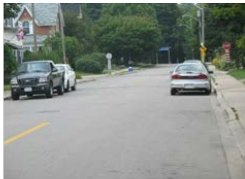
Figure 7 – On-street Parking on Both Sides, James St., Milton, ON

On-street parking is a practical way of decreasing the effective road width by allowing vehicles to park adjacent and parallel to the road edge. This type of measure is applicable on most local and collector roadways. The primary benefit of allowing on-street parking as a traffic calming measure is the reduction in vehicle speeds due to the narrowed travel space. In newer City subdivisions some roadways have a narrower design to accommodate parking on only one side (parking banned on opposite side). In this situation, changing the parking configuration to permit parking on both sides is not recommended.