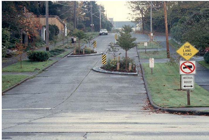
Figure 5 – One-lane chicane 12

One-Lane Chicane has a set of two or more alternating curb extensions that narrow a two-lane road to a one-lane road for a short distance. Chicanes require drivers to slow down to drive around them. The effect is to create a serpentine or snake-like driving pattern. Depending on the width of a roadway, chicanes can also be achieved by alternating on-street parking. The Canadian Guide to neighbourhood Traffic Calming does not recommend using a one-lane chicane on transit or emergency routes.