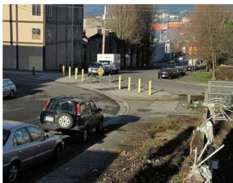
Figure 14 – Diverter