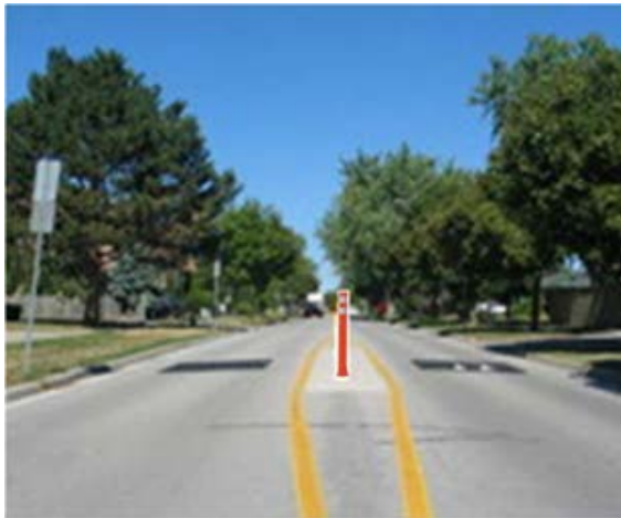
Figure 1 – Speed cushion with Mountable Centre Median, Oakville, ON 8

Speed Cushions are small speed humps designed to slow passenger vehicles but are typically designed so that the wheel base of emergency vehicles straddle the speed cushion. The wider wheelbase on emergency vehicles allows them to pass over the speed cushion without slowing down. Speed cushions can be sized and designed in sets of 2-3 cushions (one in the middle and one on each side). Another technique is to use a mountable centre island design with a 'knock-down' post in the middle (shown in picture below). The separation between speed cushions is designed with enough space for emergency vehicles to avoid touching the speed cushions and thus not having to slow down. Speed cushions may be used on local and collector roadways with design modifications tailored to suit individual roadway dimensions to ensure smooth passage for emergency and transit vehicles. Speed cushions are not used during winter months.