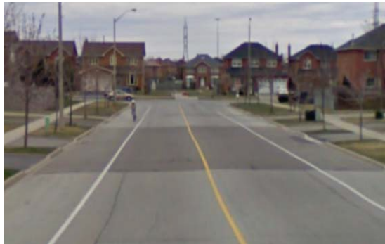
Figure 10 - Road Diet, Mississauga, ON

Road diets are a new technique used to better define road space for various users and to encourage motorists to slow down. In many cases, wide local and collector streets do not have pavement markings (other than a centre line in the case of collectors) to clearly indicate where motorists should drive. Road diets involve the addition of pavement markings to define driving space, parking space, and, in some cases, bicycle facilities. More clear definition of driving space can induce drivers to reduce their speed. Road diets can be applied to local and collector roadways.