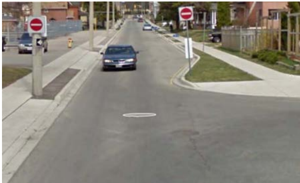
Figure 10 – Road Diet, Mississauga, ON

Raised median through intersection. These devices may be used on the centerlines of local and collector roadways to prevent left-turn and through movements to and from intersecting streets. This type of device is especially effective at preventing short-cutting and through traffic while providing some secondary pedestrian safety benefits.