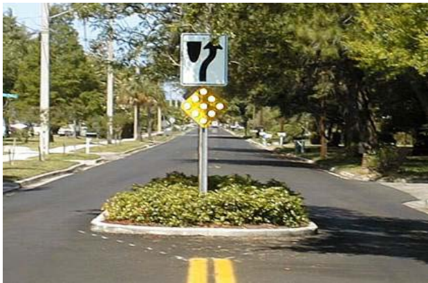
Figure 12 – Raised Median through Intersection, Kitchener, ON

Raised median through intersection. These devices may be used on the centerlines of local and collector roadways to prevent left-turn and through movements to and from intersecting streets. This type of device is especially effective at preventing short-cutting and through traffic while providing some secondary pedestrian safety benefits.