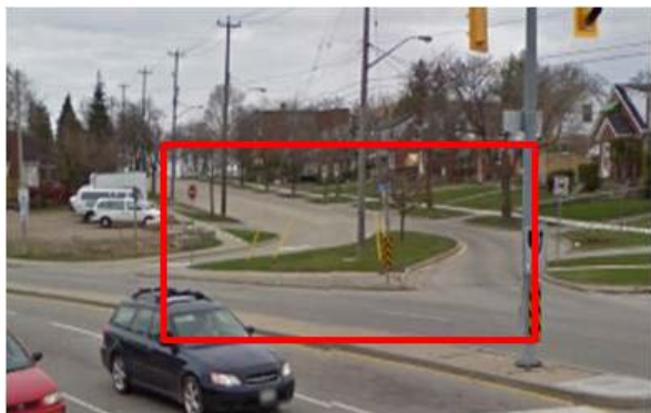
Figure 13 – Intersection Channelization and Right-in/Right-out Island, Kitchener, ON

Intersection channelization is used to delineate specific movements at or through an intersection. They typically restrict access to and from cross-streets and therefore impact access to neighbourhoods for residents and emergency vehicles. They may be used on both local and collector roadways. The following techniques could be used where significant short-cutting problems exist and should only be considered in extreme circumstances, as they severely restrict access for residents. The following two techniques should not be used on transit or emergency routes: