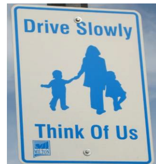
Figure 18 - Scott Blvd., Milton, ON

The sign is meant to serve as a reminder for motorists to “turn off” the highway driving mode and to be aware that they are entering a residential area where reduced speeds are required to negotiate vehicles entering and exiting driveways as well as the potential for children to be playing adjacent to the roadway.