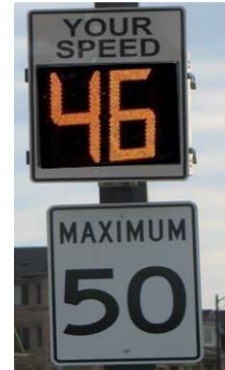
Figure 17 - Whaley Way, Milton, ON

Driver Feedback Boards are pole-mounted devices equipped with radar speed detectors and an LED display. The boards are capable of detecting the speed of an approaching vehicle and displaying it back to the driver. When combined with a regulatory speed limit sign, a clear message is sent to the driver displaying their vehicle speed. The objective of the program is to improve road safety by making drivers aware of their speed, evoking voluntary speed compliance.