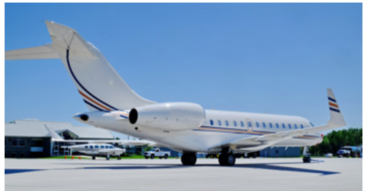
📍 Lake Simcoe Regional Airport

Lake Simcoe Regional Airport Aerospace Development Fund to stimulate private sector investment