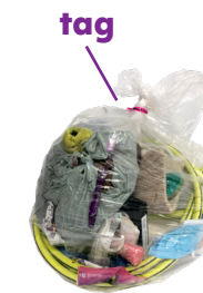
tag on top item