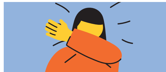
Cough into Your Sleeve