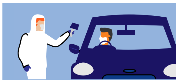
Visit an Assessment Centre