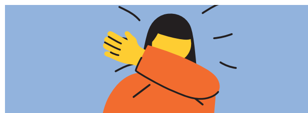
Cough into Your Sleeve