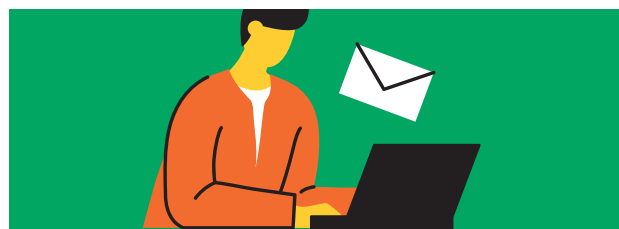
Self-Isolate for 14 Days After Travel