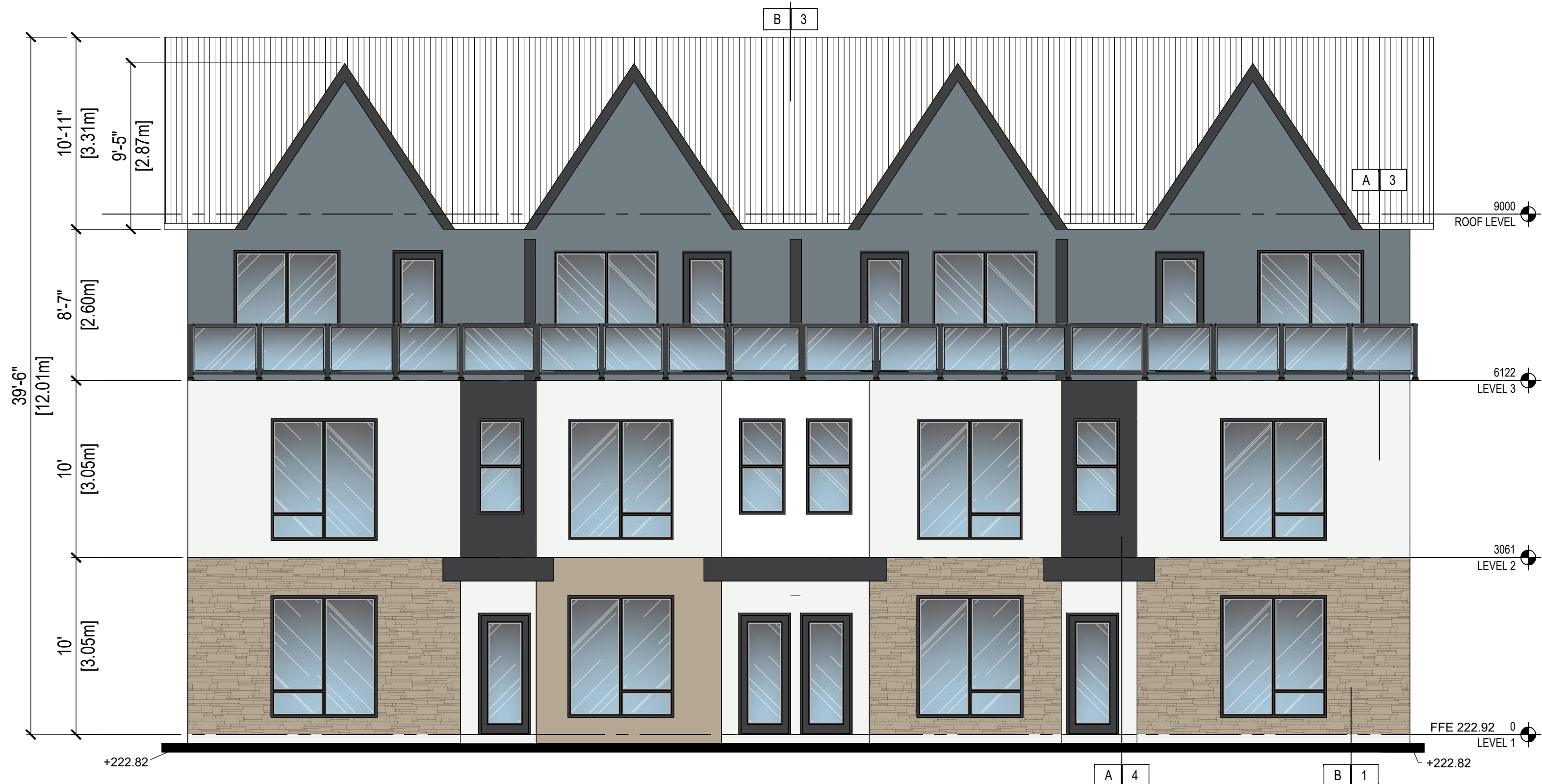
1 SOUTH ELEVATIONS 3/16" : 1'-0" (PARKING AREA / INTERIOR SIDE YARD PARKING)