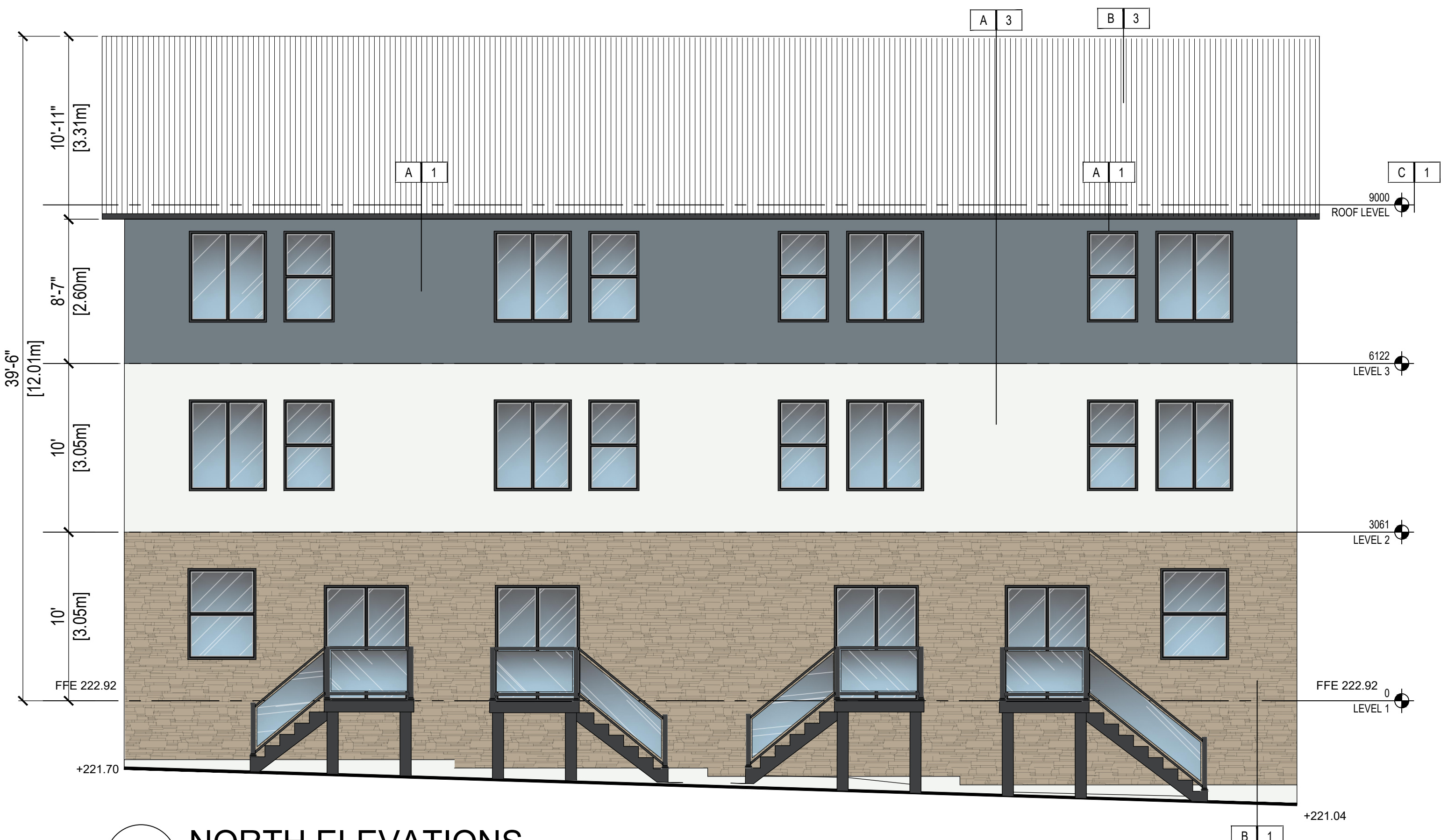
2 NORTH ELEVATIONS 3/16" : 1'-0" (FACING INTERIOR SIDE YARD)