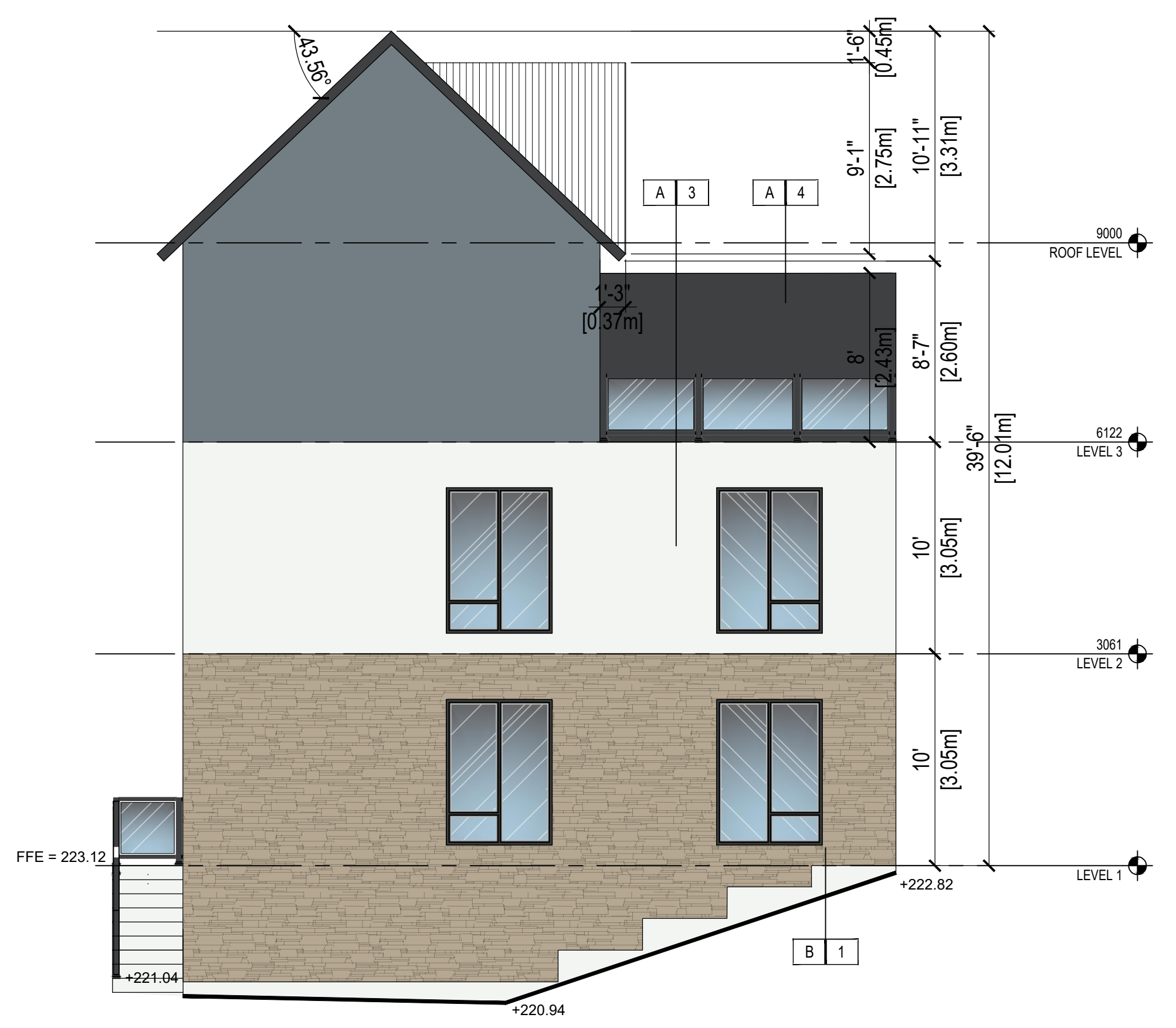
3 WEST ELEVATIONS 3/16" : 1'-0" (FACING COMMON AMENITY AREA / REAR YARD)