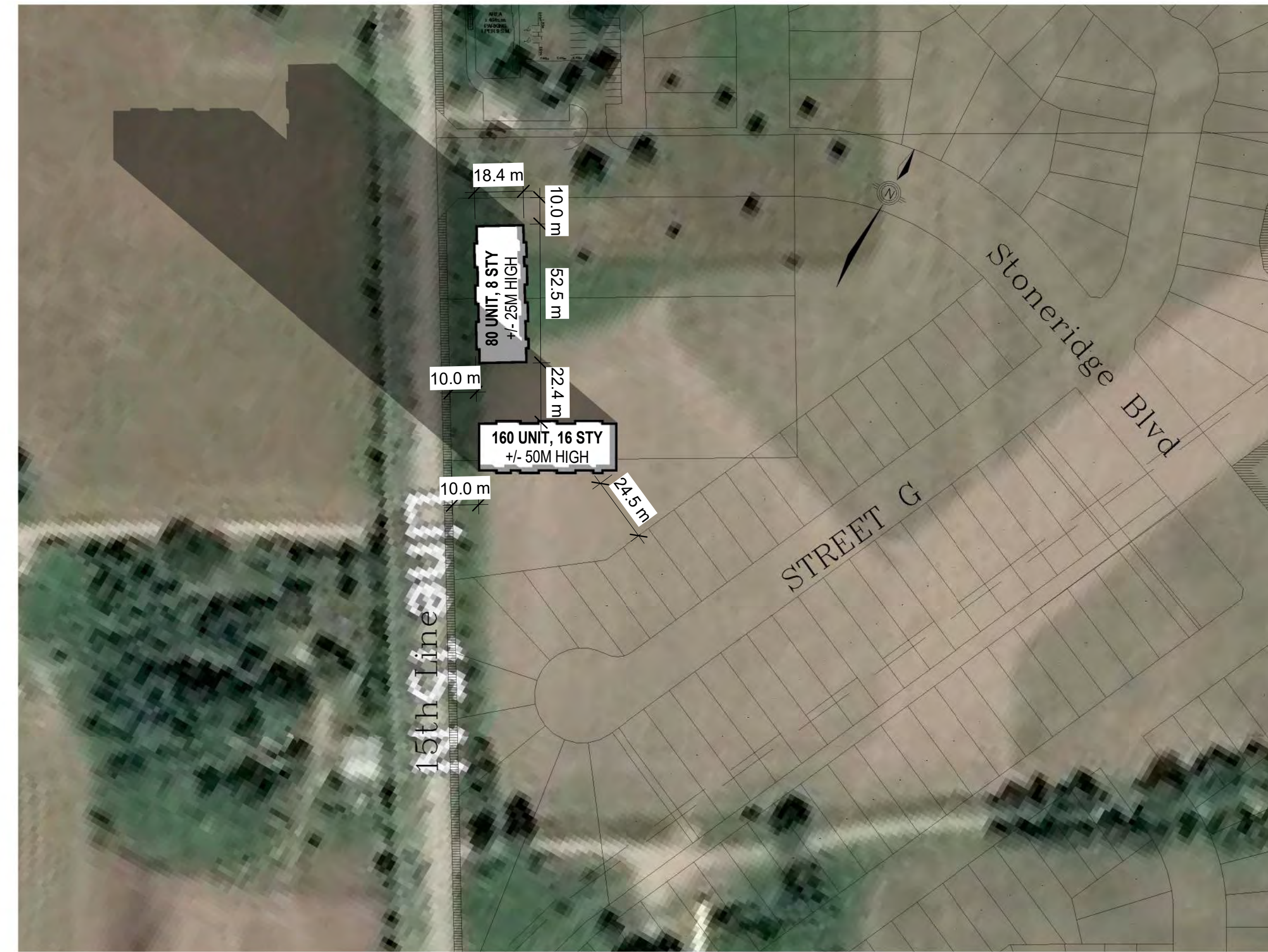
2 DECEMBER 21 - 11AM A1.4 1:1500