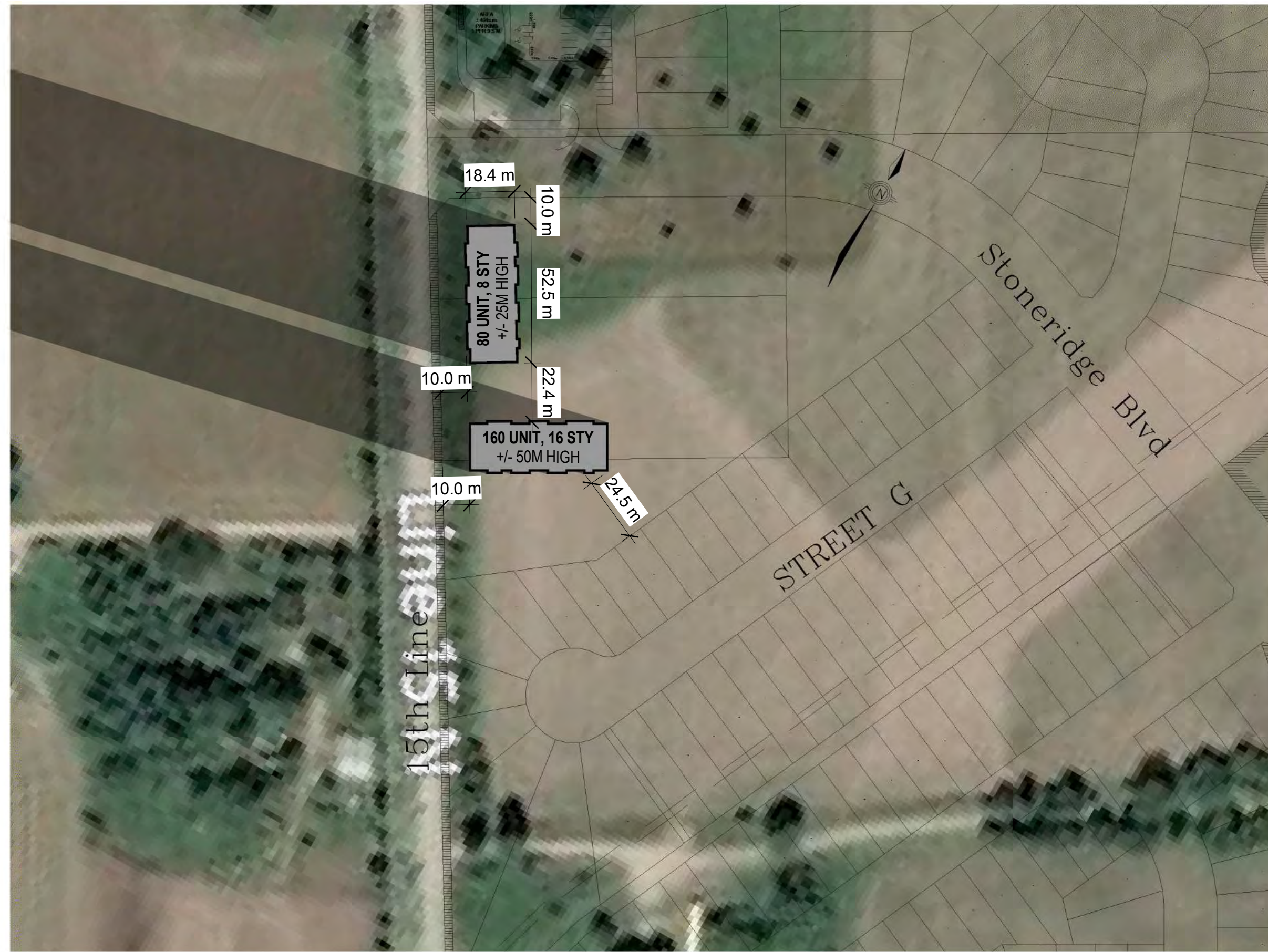
1 DECEMBER 21 - 9AM A1.4 1:1500