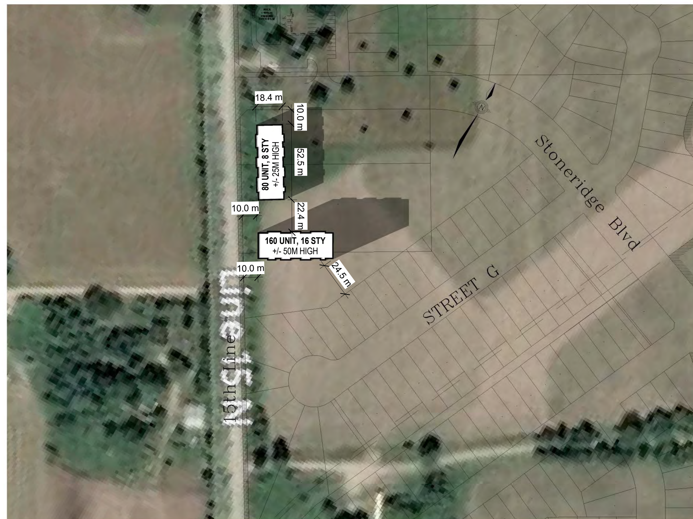
4 JUNE 21 - 5PM A1.2 1:1500