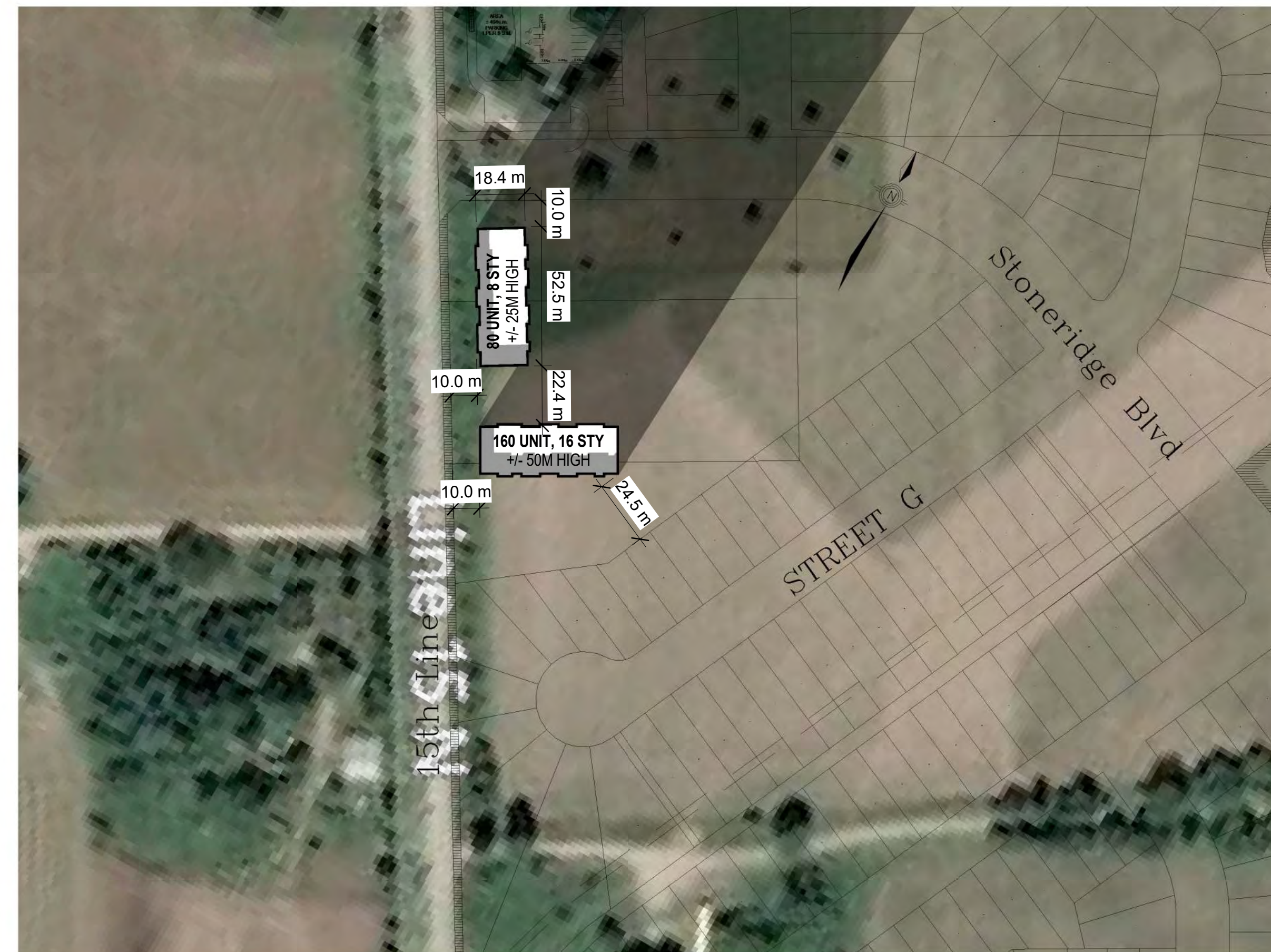
4 DECEMBER 21 - 5PM A1.4 1:1500