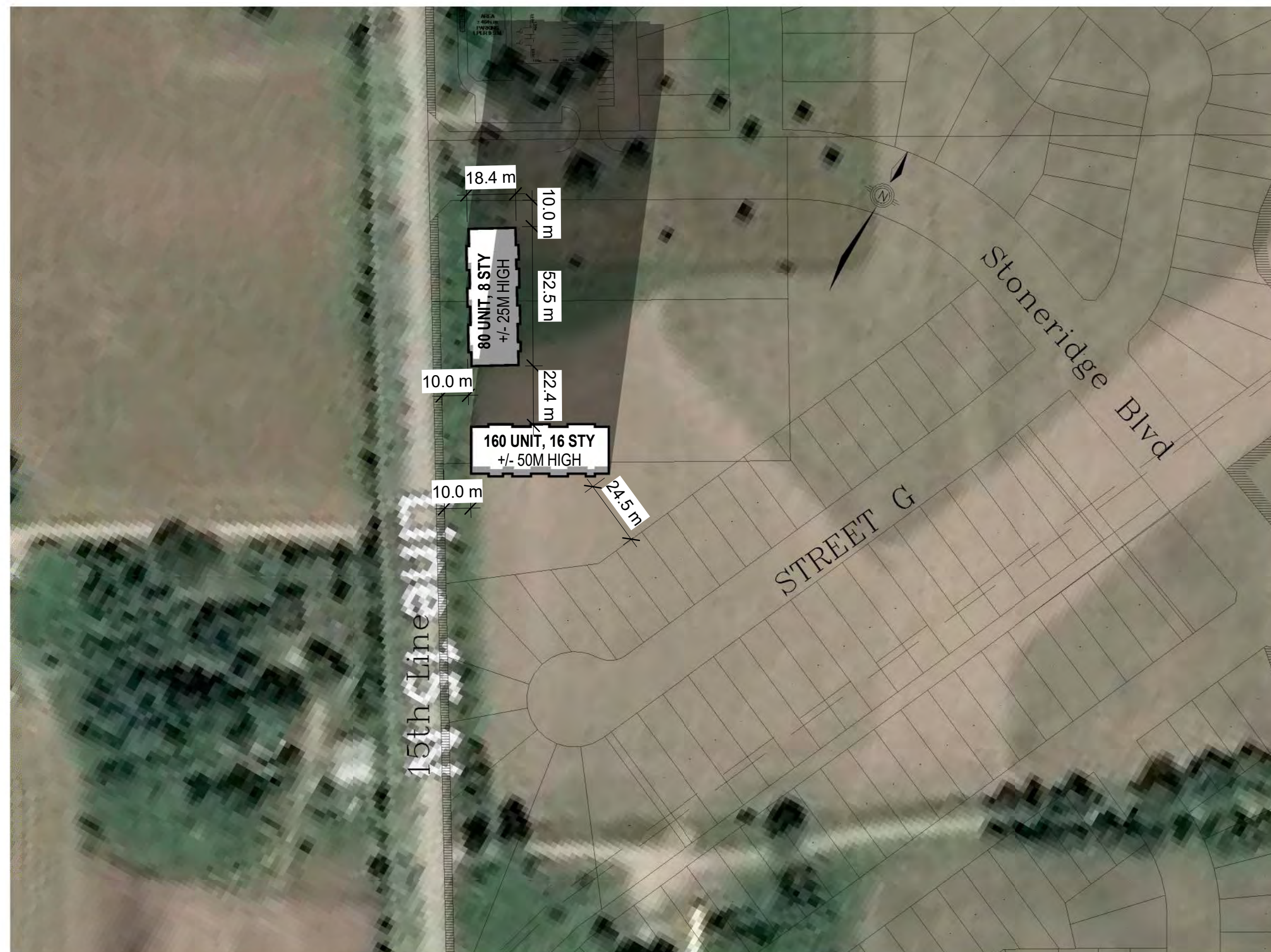
3 DECEMBER 21 - 3PM A1.4 1:1500