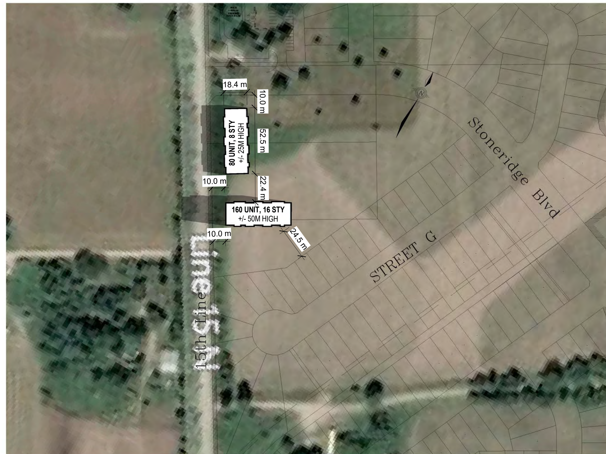
2 JUNE 21 - 11AM A1.2 1:1500