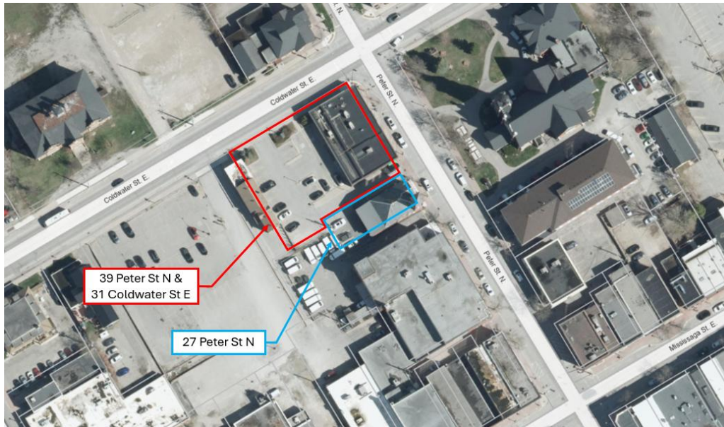
Figure 1: Aerial View of the Serviant Lands and Dominant Lands