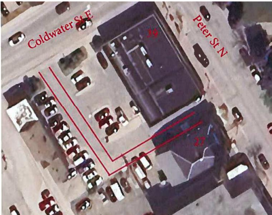
Figure 2: Area Subject to Easement